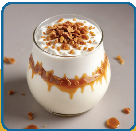
Rich caramel color

CARANESS Salted Butter Caramel Flakes CSF24SB offer rich caramel color, texture, and flavor with notes of caramelized sugar, a hint of salt, and browned butter. They can be used in confectionery as a topping, mix-in, flavor accent, or decorative finish to many confectionery applications.