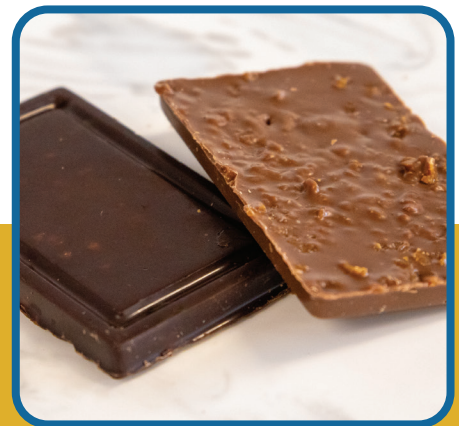
Sweet and salty flavor

CARANESS Elevating the Craft of Caramel.