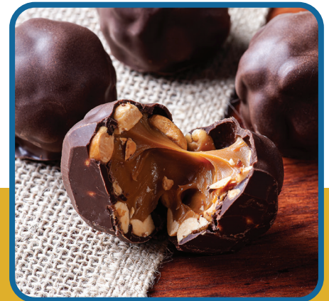
Sweet and salty flavor

CARANESS Elevating the Craft of Caramel.