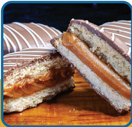
Rich caramel color

CARANESS Salted Butter Caramel Sauce CSP83SB offers rich caramel color, smooth texture, and balanced flavor with notes of caramelized sugar, light salt, and browned butter. It works well in confectionery as a topping, filling, inclusion, or one-shot applications.