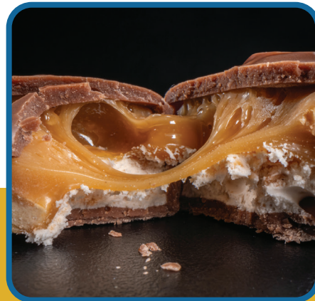
Smooth and creamy texture